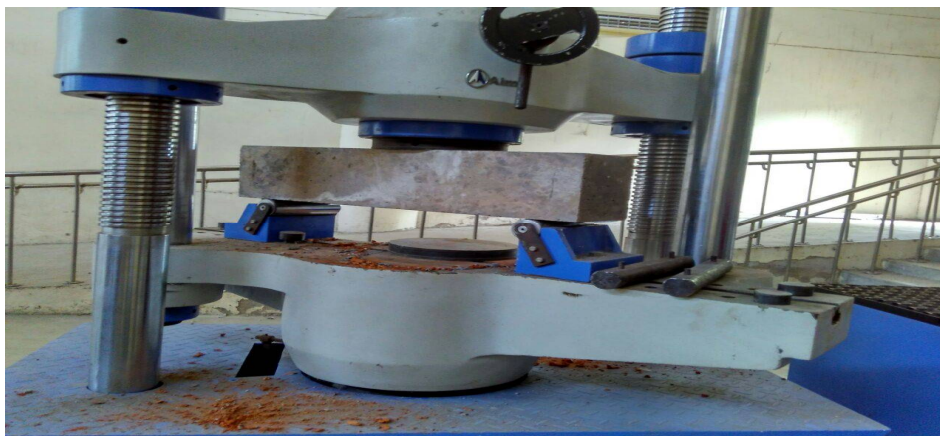
Fig. 4. 3 point load test using UTM

Point bend Test: This is a compression test where you support a length of material by spanning it across two supports on each end. There is nothing supporting the middle portion underneath of it. Then you press down from above directly in the middle of the span of material until the supported material breaks or reaches a specific distance. This test measures how strong the material in flexure (flexural strength).