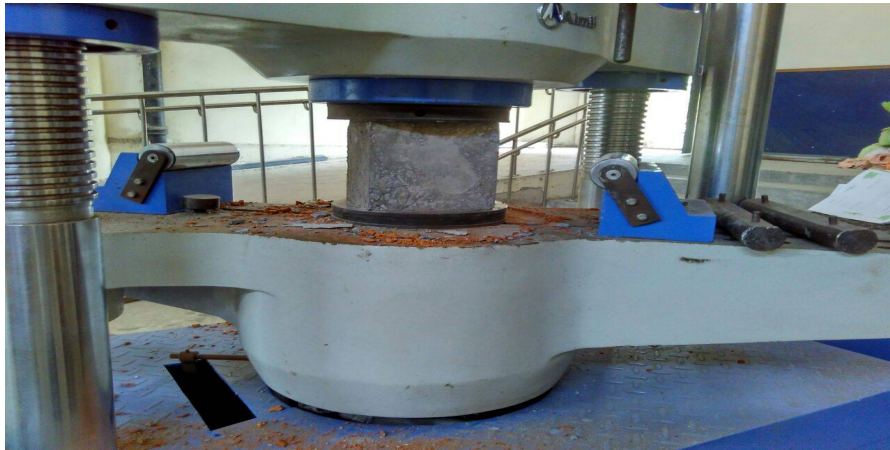
Fig 1. A universal testing machine (Earthquake Lab, Civil Dept. DTU)