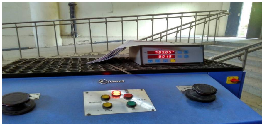
Fig. 2. UTM digital output device